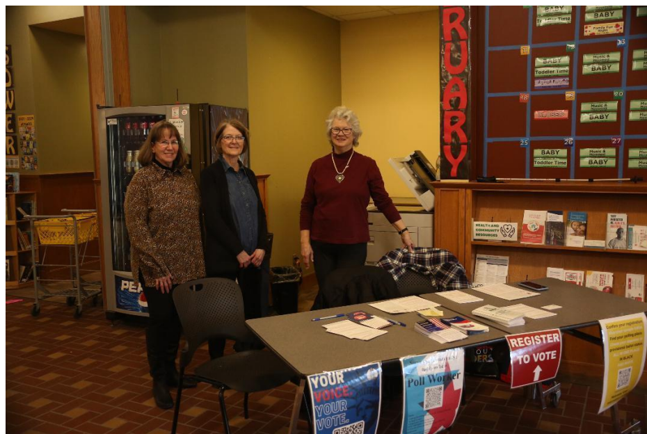
Voter Registration, Gere Library, February 17, 2024